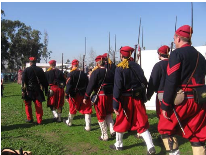
Marching at Knott's, 2010

Parking passes, releases, and safety rules are on the www.civilwaralliance.com web site. Download the parking pass and place it on your vehicle's dash OR YOU WILL BE CHARGED TO PARK!